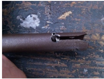
Predrilled hole aligned and pin inserted