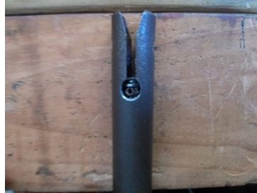
Spring pin centered with diameter of shaft.